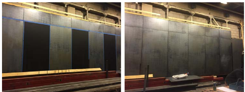
From primer to finish – using the seams of the materials to her advantage helps create that rolled metal sheet effect

I began my paint sampling with the easiest answer – silver paint from my local big box store. Guess what! Silver paint ain't steel – it just looked cheap and it didn't have any of the depth and the color changes that I needed to create a rolled steel effect. After lots of experiments, I realized that if I created a silver tinted glaze and gently rolled it over the Tough Prime Black base, I could get some stellar results.