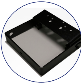
Hanging Truss Adapter Option Available