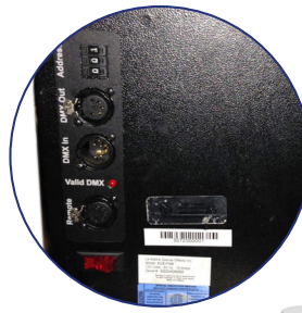
Built in 5-Pin DMX control for Fan & Flow Settings