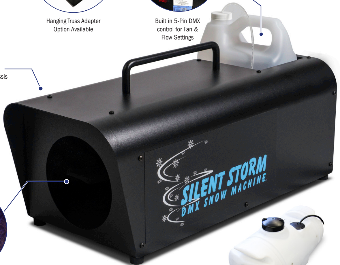
Powder coated stainless steel chassis