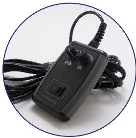
Variable Output, Timer Remote Included