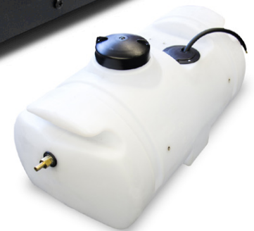
Fluid Distribution System (FDS) available (25 gallon tank shown)