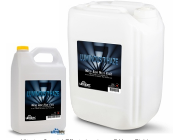
Ultratec Special Effects Luminous 7 Haze Fluid

This fluid was specifically designed to be used in our Radiance Haze Machine. This water-based fluid creates an evenly dispersed haze that is dry and long lasting without leaving any residue. It produces a premium quality, beautiful haze that illuminates the light and laser beams from ceiling to the floor. Luminous 7 Haze Fluid has a high concentration of an active ingredient that allows for low fluid consumption and is completely safe.