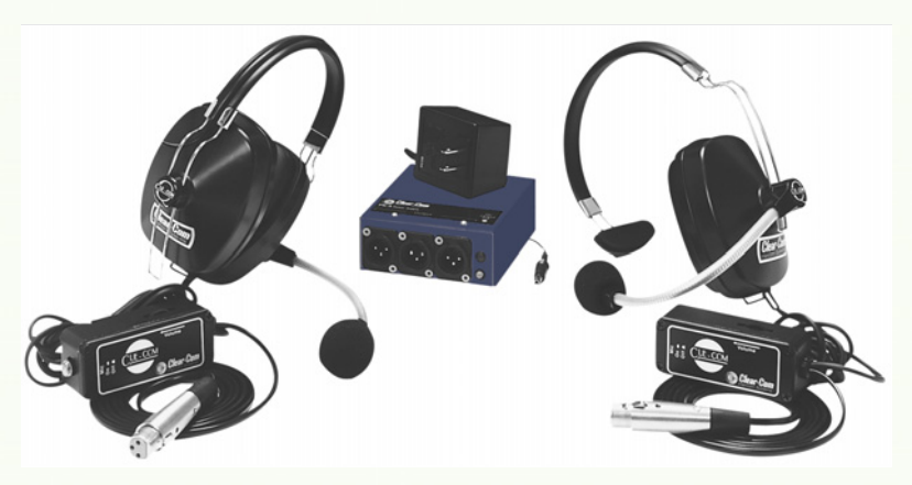
Que Comm Single-Channel Intercom System

Que-Com intercom systems are a compact, cost-effective, portable solution to many intercommunications needs. It consists of a PK-7 intercom power supply, and a choice of either one-ear (SMQ-1) or two-ear (DMQ-2) headset stations with an integral boom mic, attached to a rugged beltpack housing the electronics. Que-Com systems are compatible with all other Clear-Com party-line intercom products.