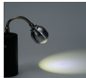
The QPin 300 comes with adjustable beam width.