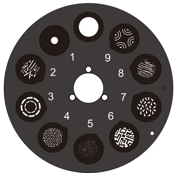
Static gobo wheel