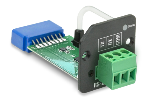
SM-RS232 RS-232 Serial Smart Module

Additionally, an LED indicator on the module provides at-a-glance operational status.