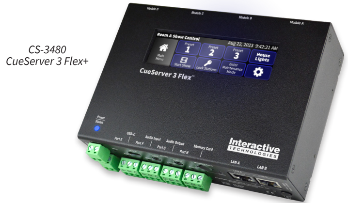
CS-3480 CueServer 3 Flex+