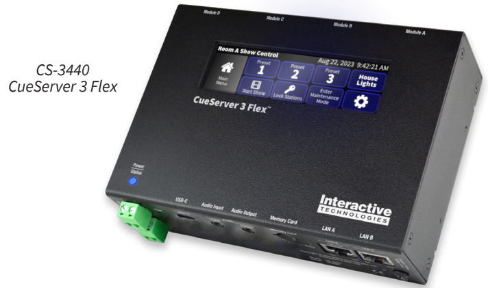
CS-3440 CueServer 3 Flex