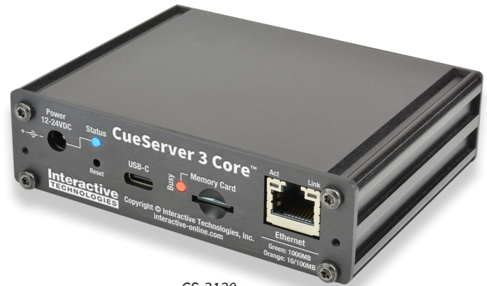
CS-3120 CueServer 3 Core D

The CueServer 3 Core D variant (CS-3120) additionally features two built-in isolated RJ45 DMX ports that can be configured as either DMX Inputs or Outputs.