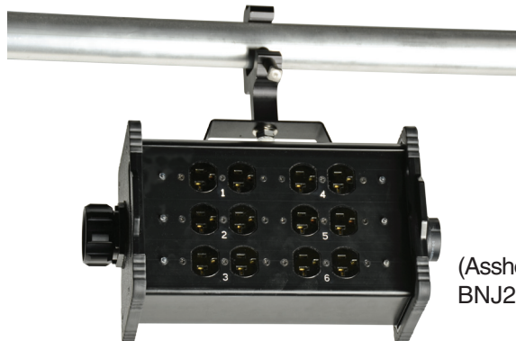
(As shown on model BNJ2-Z3-CLP)