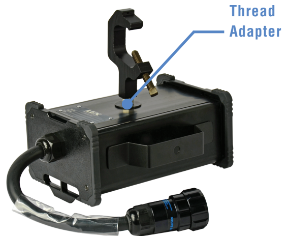
With Thread Adapter for Vertical Mounting