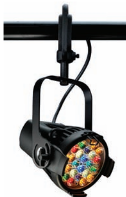
DESIRE D22 PORTABLE