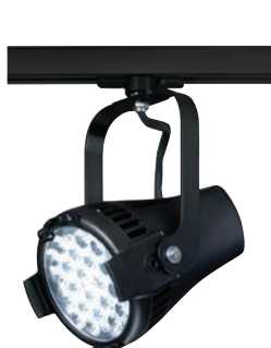
DESIRE D22 TRACK-MOUNT