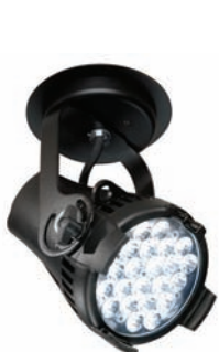
DESIRE D22 CANOPY-MOUNT

The Desire D22 is available in three installation types: a portable version that accepts standard C-clamps, a canopy-mount design, and a track-mounted model. It can be used for permanent installations, fitting into the tightest spaces in lobbies, art galleries, theaters, museums or any location where larger fixtures can't go. And pairing the D22 with an ETC Source Four Mini™ creates a pocket-sized hybrid-lighting duo, with easy plug-and-play setups.