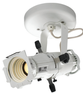
SOURCE FOUR MINI LED CANOPY-MOUNT