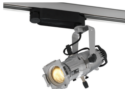
SOURCE FOUR MINI LED TRACK-MOUNT