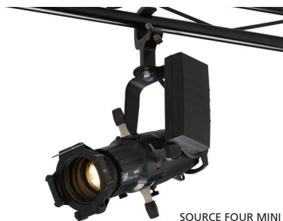
SOURCE FOUR MINI LED PORTABLE