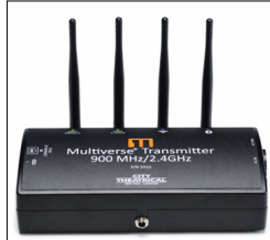
Standard antenna for Multiverse Node and Transmitter products

The 2dBi/4dBi Omni Broadband Antenna, 900MHz/2.4GHz, Dual Band (P/N 5980) is the standard antenna for City Theatrical's Multiverse® Node (P/Ns 5902 and 5903) and Multiverse Transmitter (P/Ns 5910, 5911, and 5912) products. Its connection is made using a RP-SMA male plug.