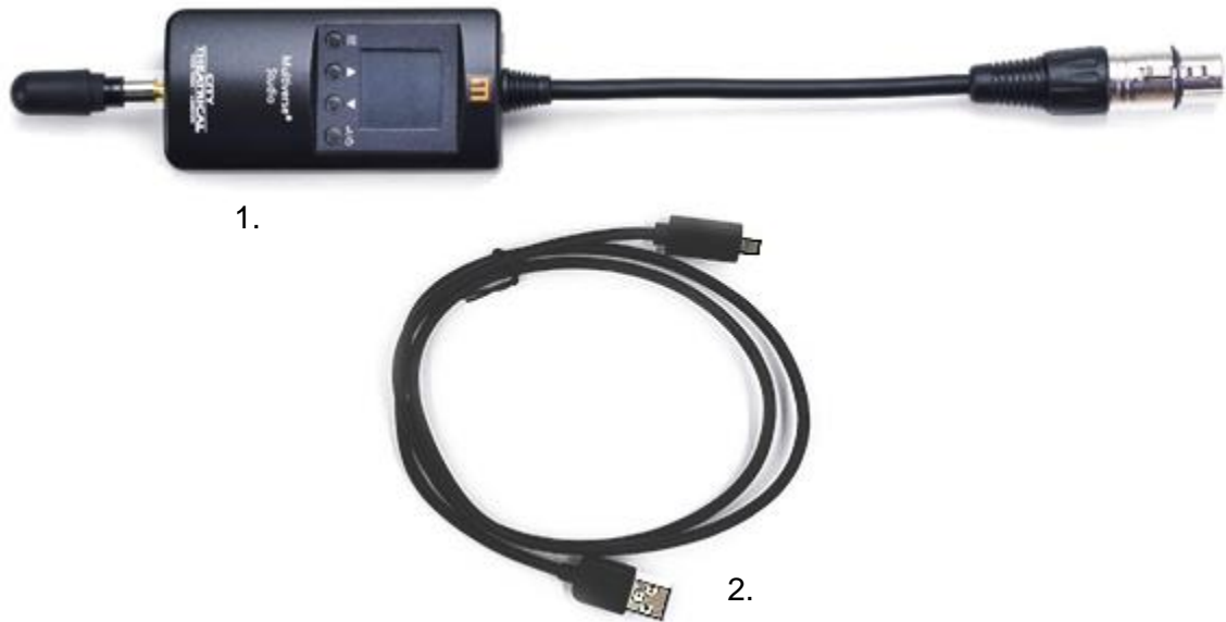
Figure 1: What's Included