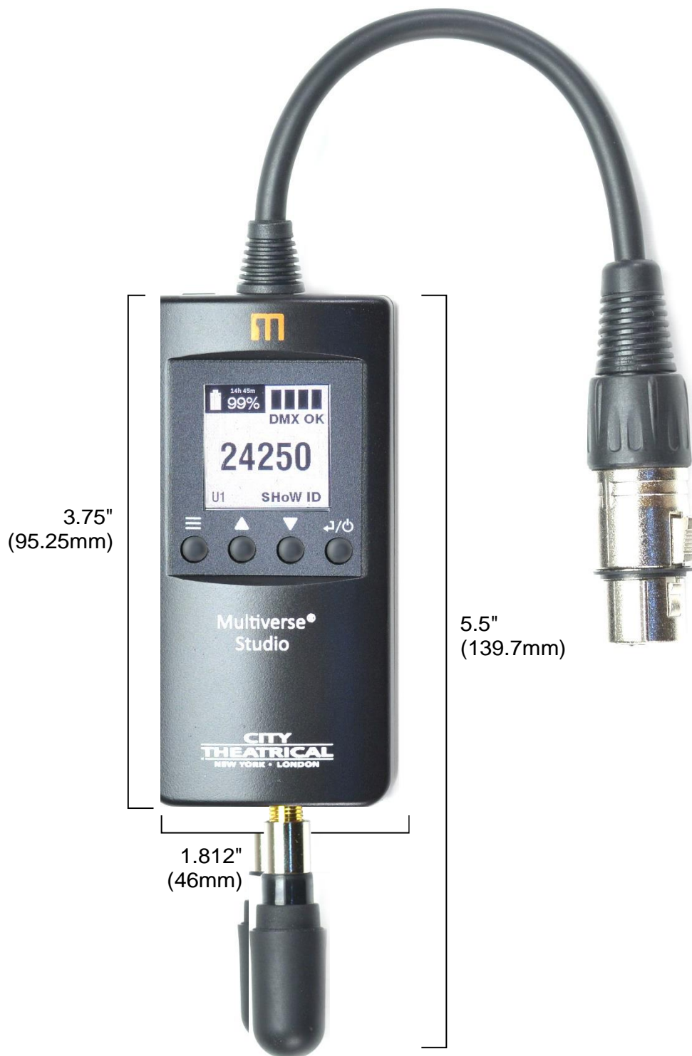
Figure 2: Face Panel