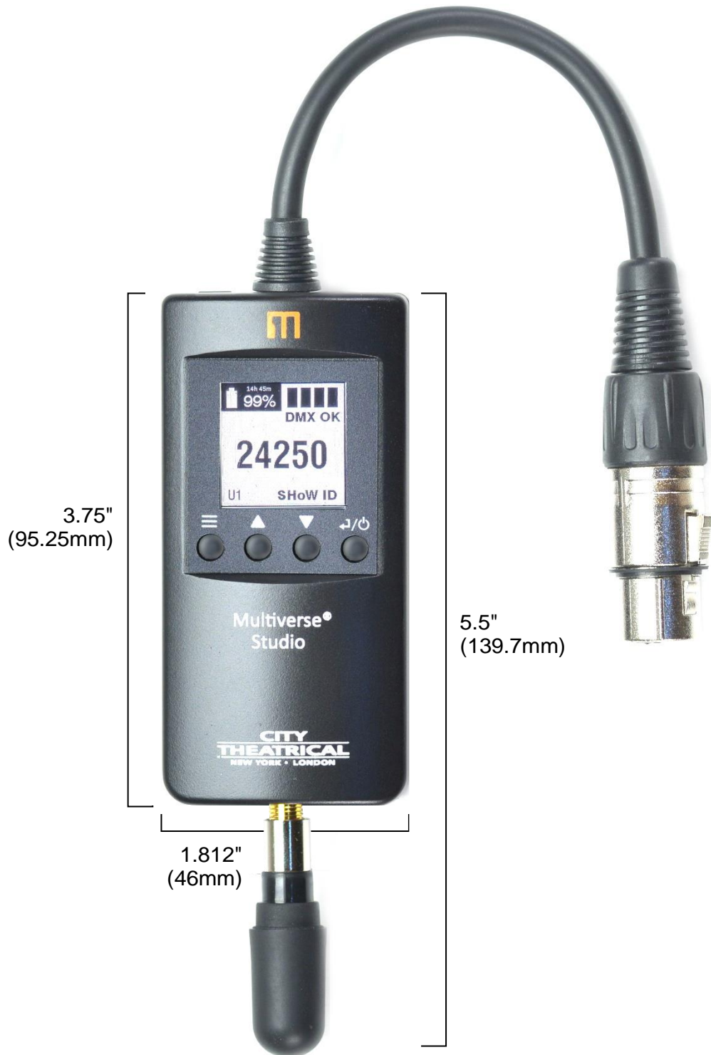
Figure 2: Face Panel