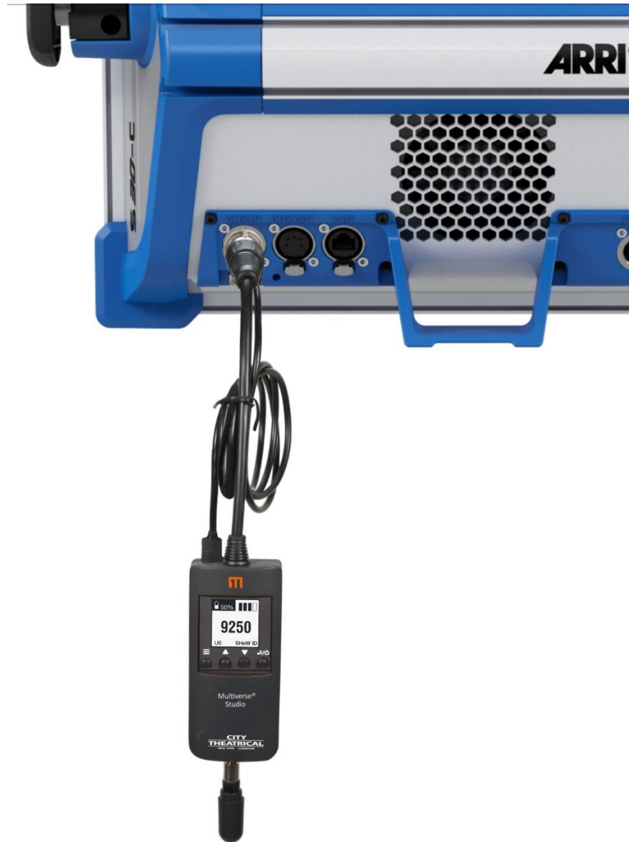
Figure 3: Connected to and Being Powered by USC Cable to Lighting Fixture